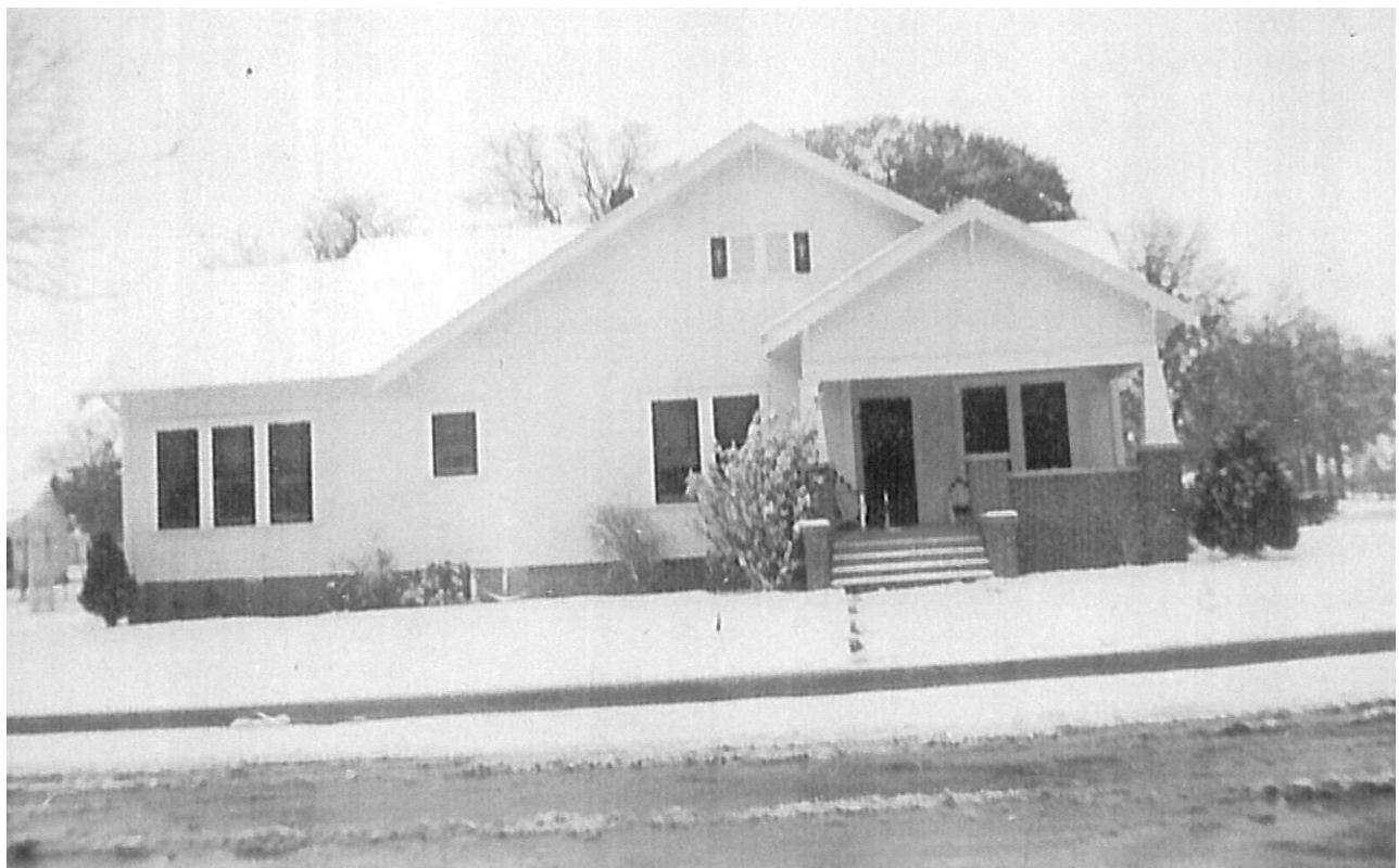
The Second Parsonage