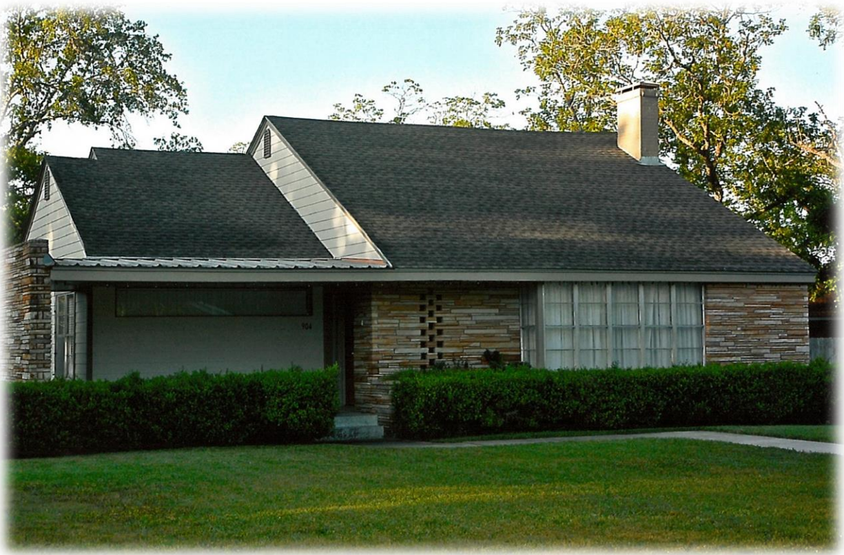
The Present Parsonage