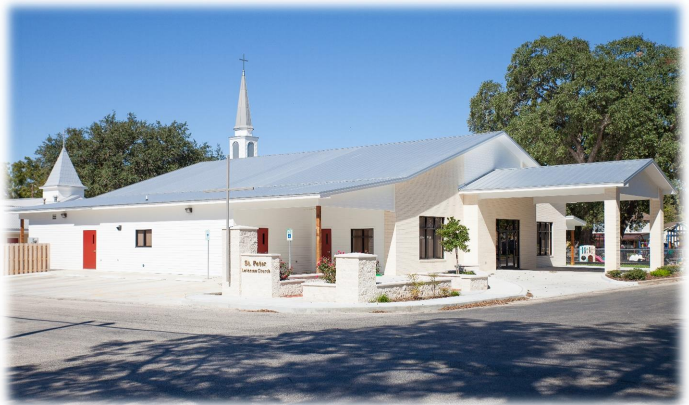
The Fellowship Hall

After the education building was built, the church basement was used as a fellowship hall. But soon, it became too small and the congregation again began to raise funds to build a new fellowship hall. Many fund raisers were held. Many cakes and pies were sold, sausage dinners served, and Cowboys and Cupid fundraisers were held at Appelt's Hill Hall. The community and congregation generously donated, and ground was broken for a new fellowship hall in 2013. By the time the building was dedicated on May 4, 2014, the congregation had raised enough money to pay for this Fellowship Hall that cost just under $ 1,000,000.