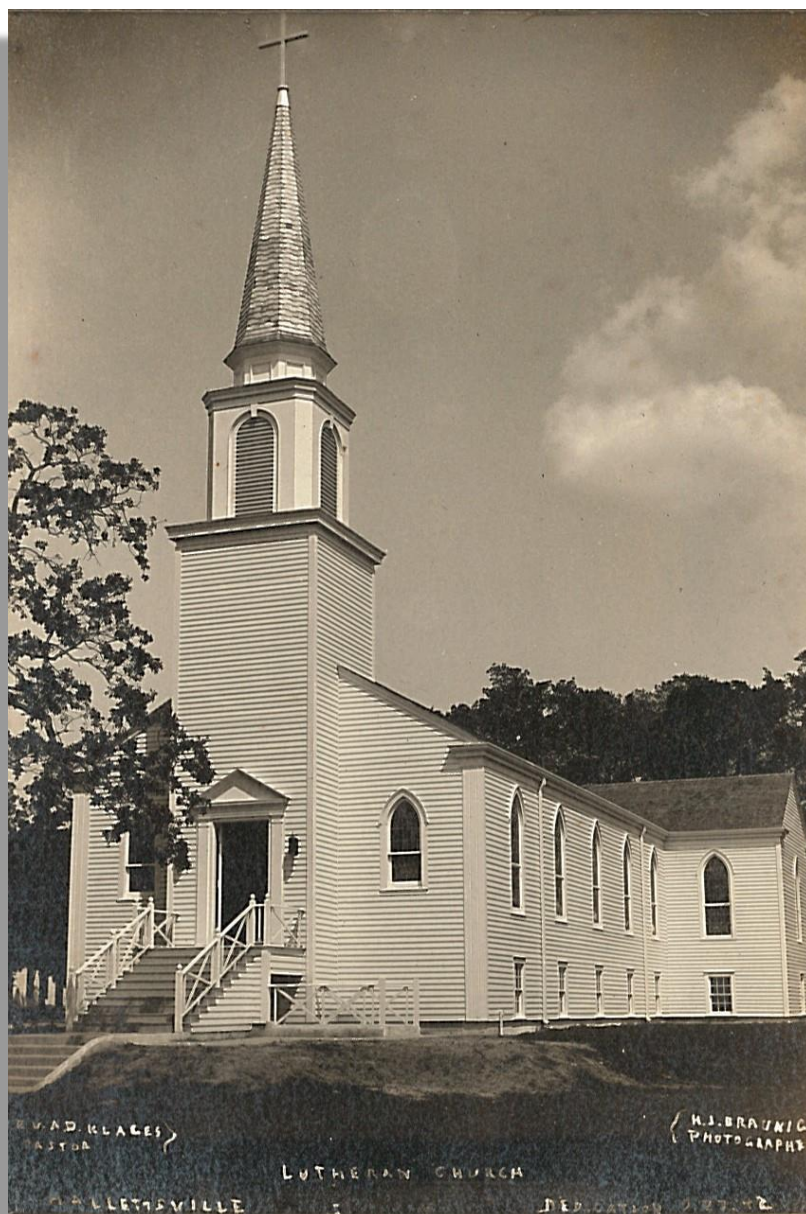
The Second Church